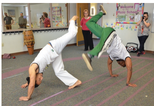
Vai Capoeira Delaware held a Capoeira Workshop showcasing the Brazilian martial art during the Cultural Crossroads event Music & Culture of Brazil , March 2015.