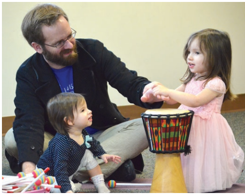
The Gutana family exploring musical rhythms at the Early Childhood Family Drum Circle, March 2015.

Multi-cultural, multi-age, multi-genre; we celebrate diversity in every form.